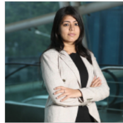
KS Legal & Associates