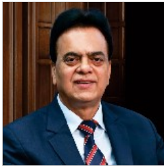
Aakash Educational Services Limited